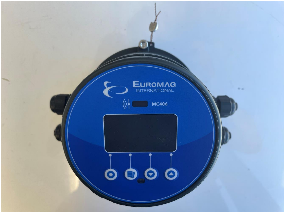
MC406/MC406A flow converter – Variant 9