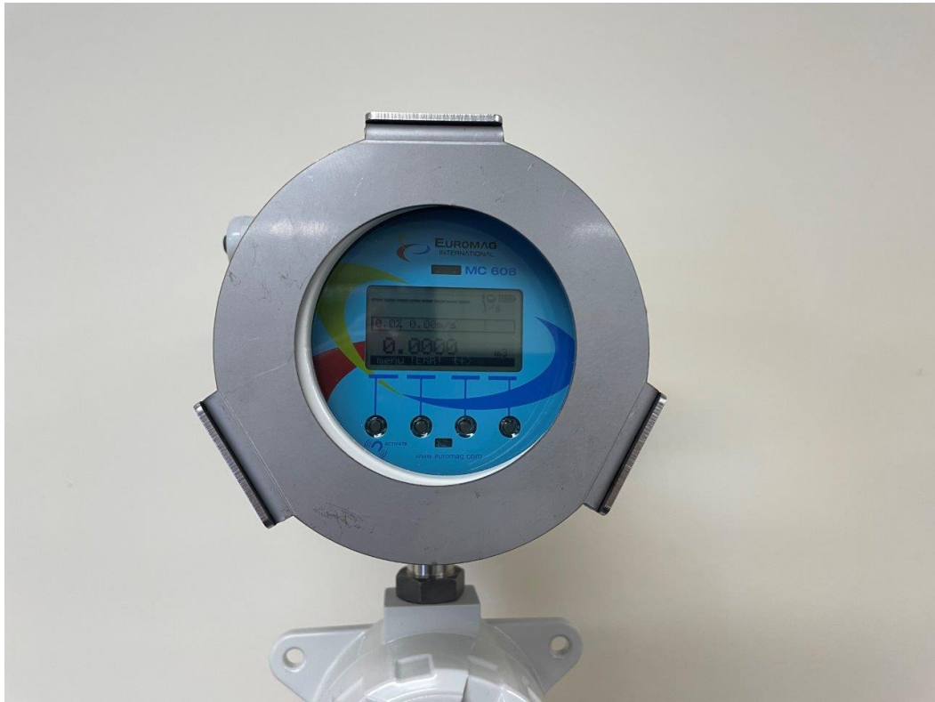
Additional sealing provisions: front – Variant 6