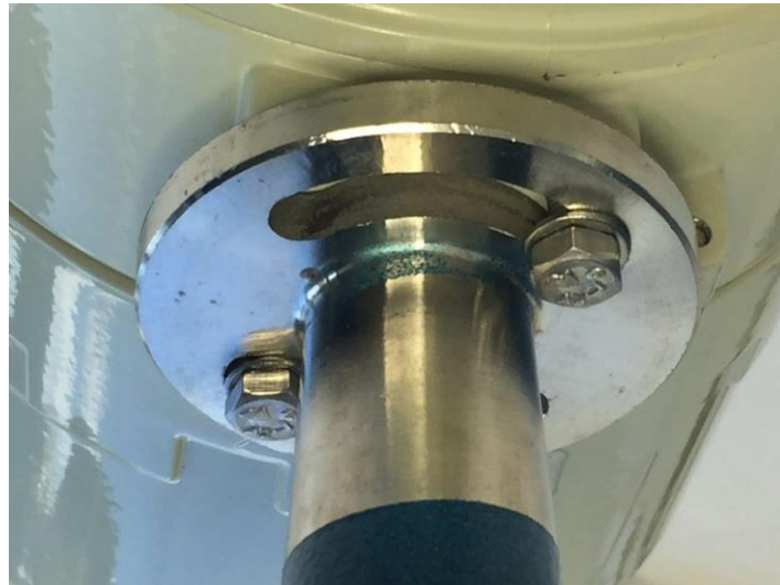
Connection Between Flow Converter and Flow Sensor To Be Sealed