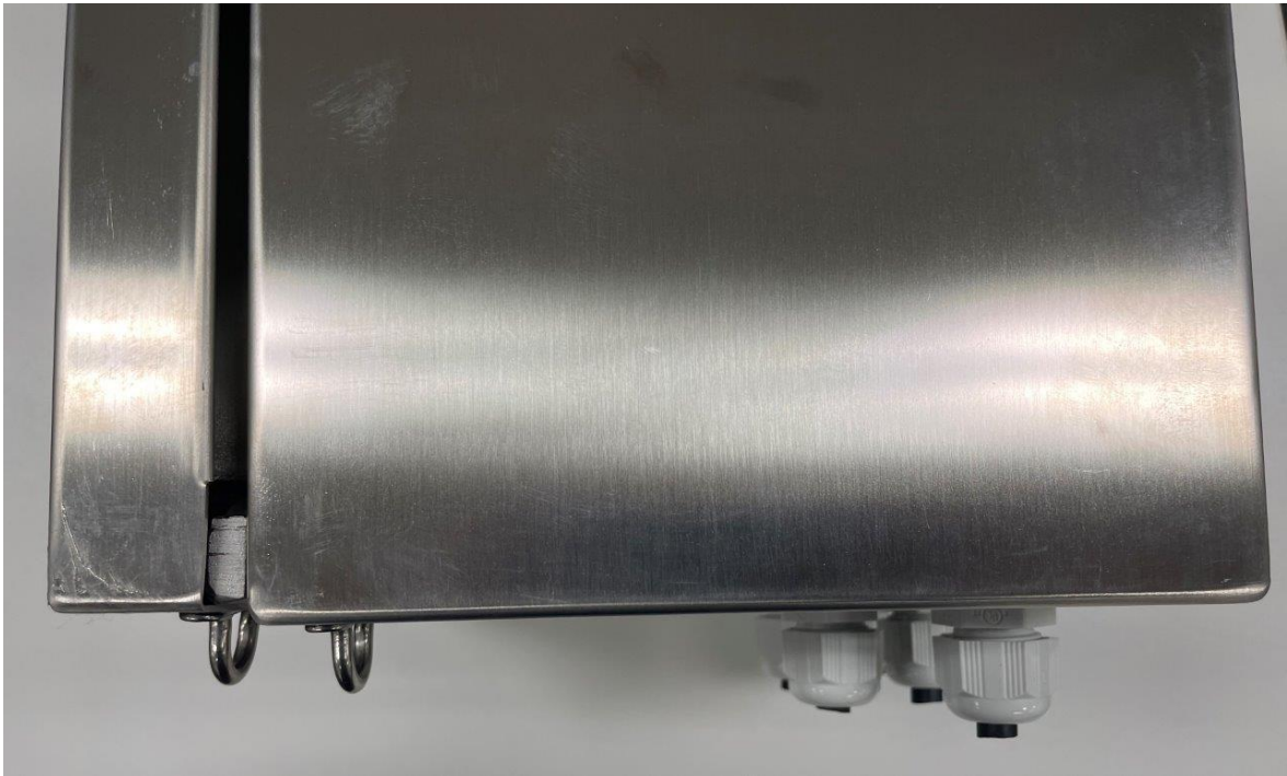
MC608I flow converter sealing – Variant 7