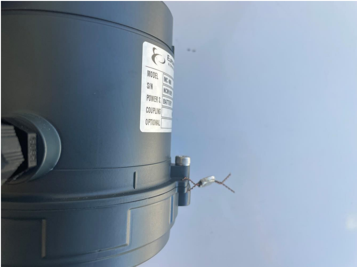
MC406/MC406A flow converter sealing – Variant 10