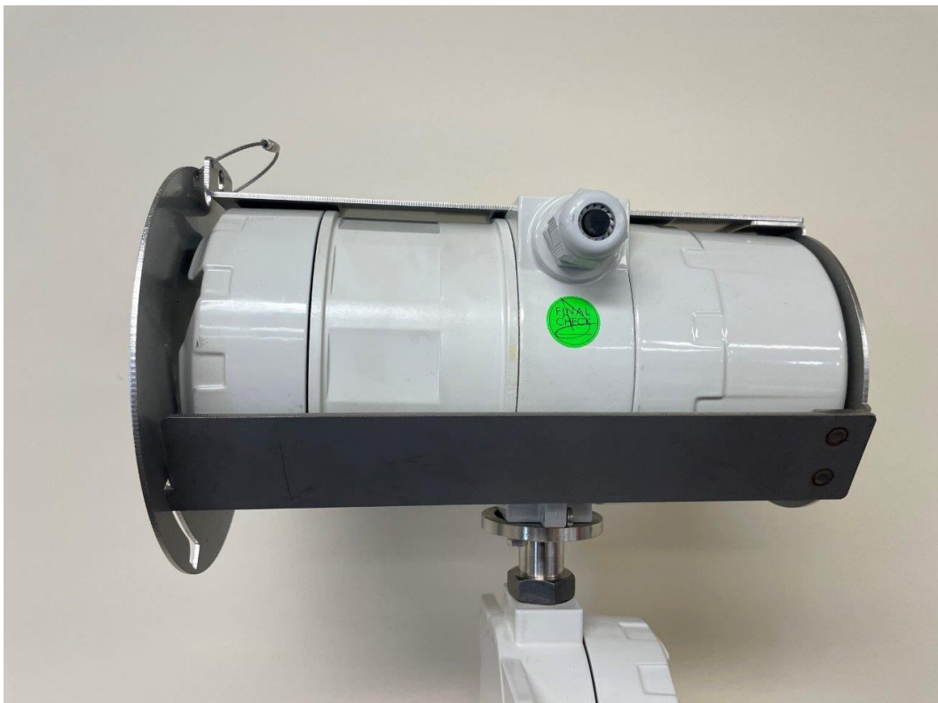
Additional sealing provisions: side – Variant 6