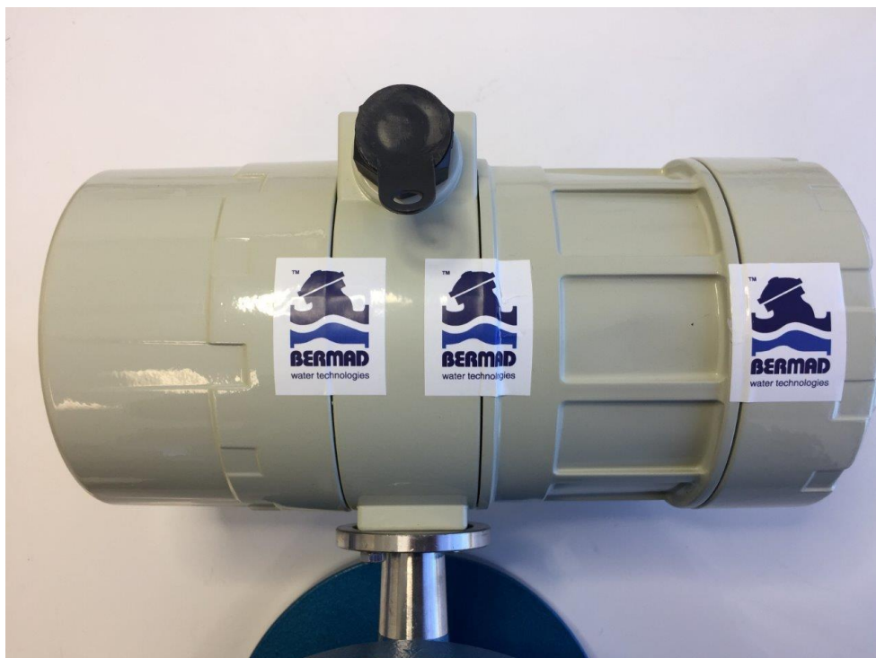
Typical Sealing of Flow Converter