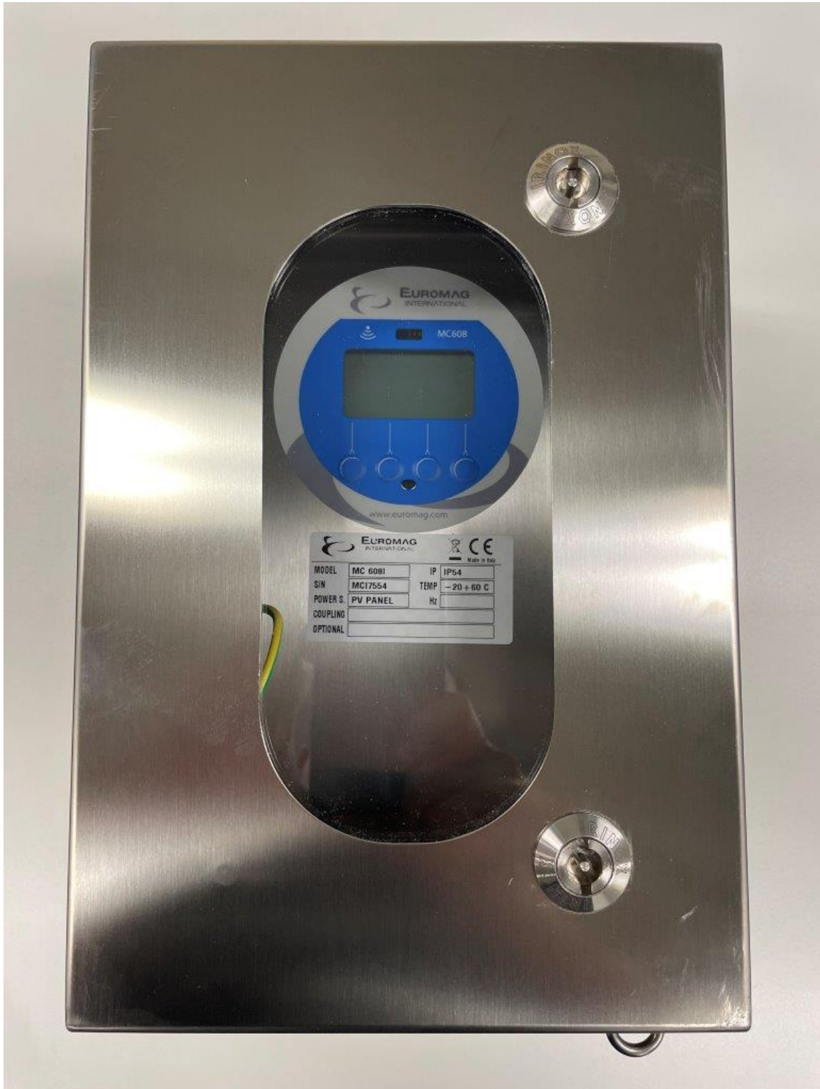
MC608I model flow converter – Variant 7