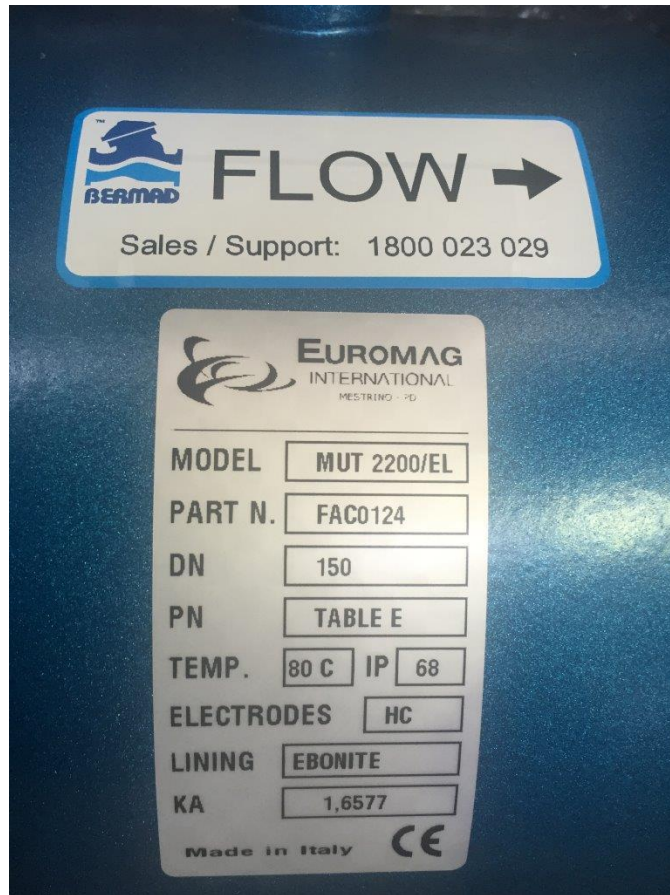
Other Markings and Inscriptions