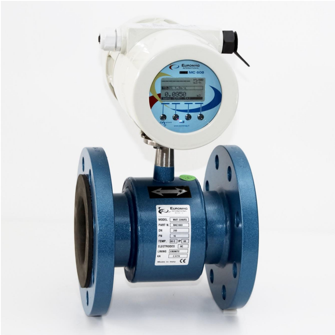
A Euromag MUT2200 EL Electromagnetic Flow Sensor and an MC608B Model Indicating Flow Converter