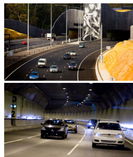
Images: Mullum Mullum tunnel Melbourne, Victoria.

For a visual view of a typical tunnel fire protection deluge system, visit the Fire Protection playlist on our YouTube channel.