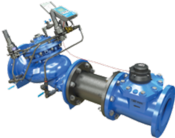
Control Valve with Water Meter