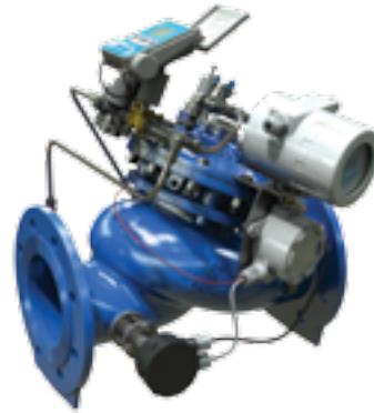
Control Valve with Insertion Flow Meter

One of BERMAD's Pressure Management solutions for optimizing water supply and reducing NRW (Non Revenue Water) - consists of the installation of a two step PRV at the entry point of the DMA (District Metering Area). During low flow demands the PRV is set to low downstream pressure. Due to low water consumption the accumulated head loss is relatively low and the pressure at the farthest consumer point (Critical Point) is almost the same as the pressure setting of the PRV, therefore leakage and bursts are significantly reduced. During high flow demands the PRV is set to high downstream pressure to compensate the relatively high accumulated head loss and maintaining the minimum services level pressure at the CP.